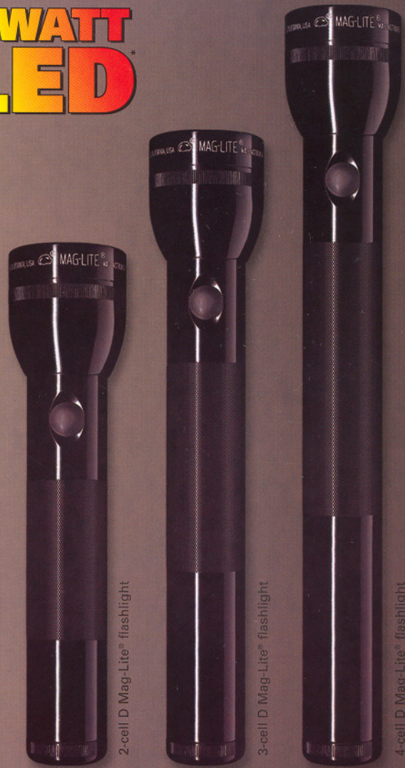
2-cell D Mag-Lite® flashlight

Mag-Lite® LED D-Cell flashlights are also offered in a variety of colors (refer to color guide below).